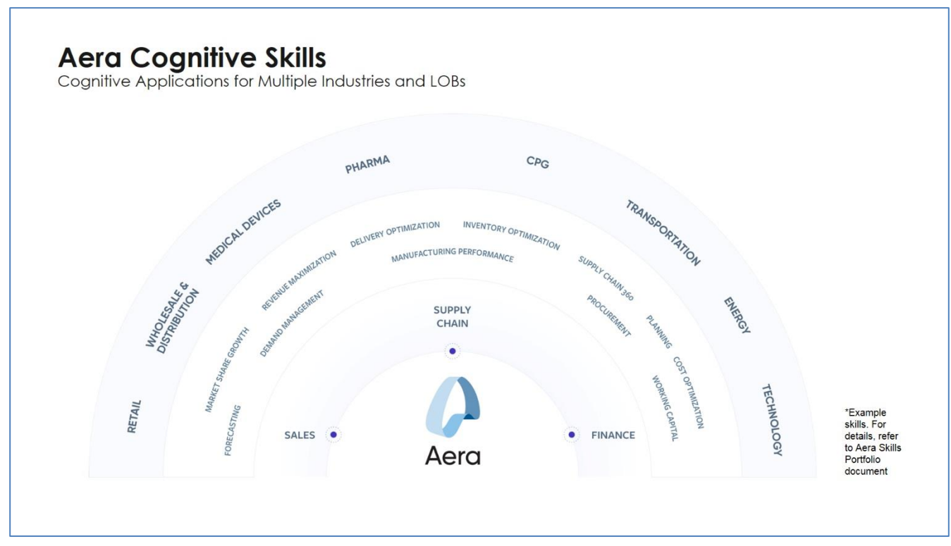
Figure 2. Some Available Aera "Skills" for Multiple Industries and LOBs

The company even has its own natural language processing (NLP) capabilities, whereby users can ask Aera verbal questions like they do with Siri, Cortana, or Alexa in English. Aera also provides partners' external NLP translations services in Spanish, Chinese, and other languages. Think of the following examples: